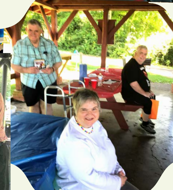
HICKMAN COUNTY PICNIC JUNE 22, 2021