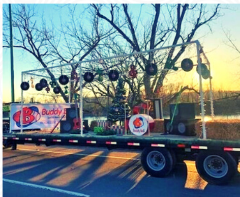
Last year's float