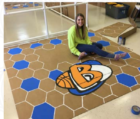
This year's float in progress