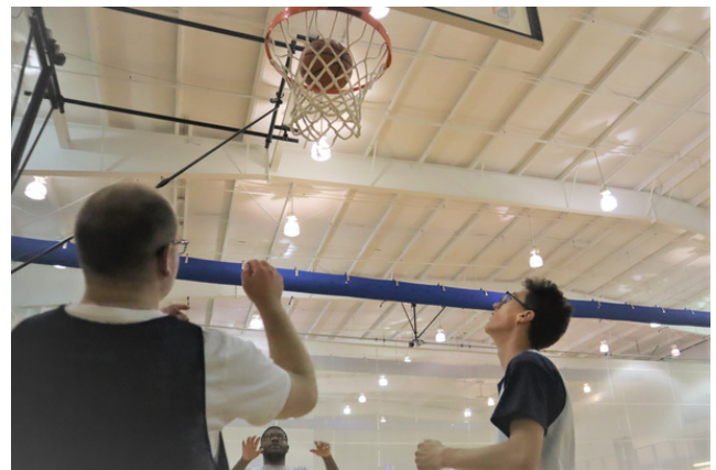
BUDDY BALL BASKETBALL, JULY 2021